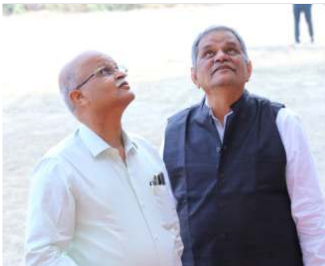
Chairman and Secretary of BAVP amazed to see the grandeur of the building.