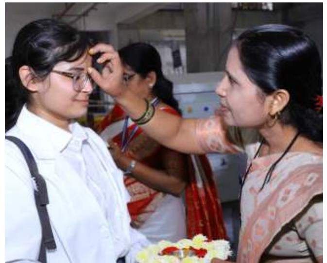
Welcomed by tilak