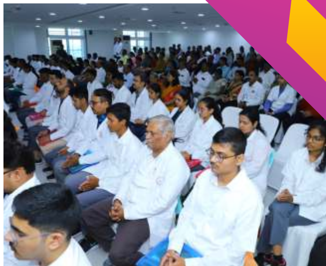
Students chanting 'Dhanwantari Stotra'